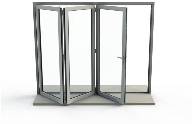
External View of Bi-Folding Doors