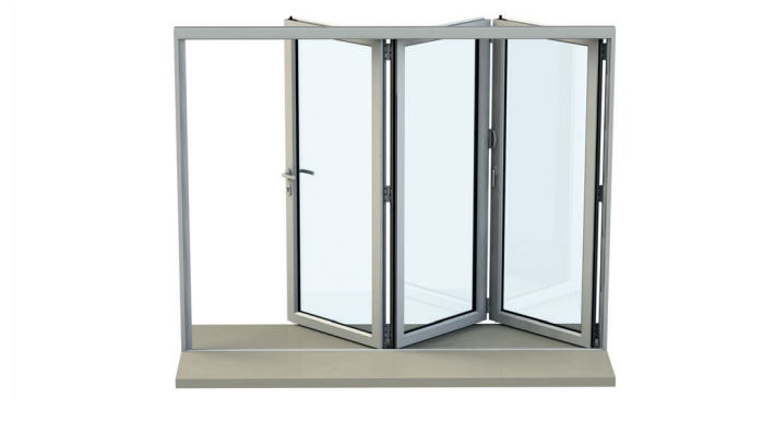
Internal View of Bi-Folding Doors